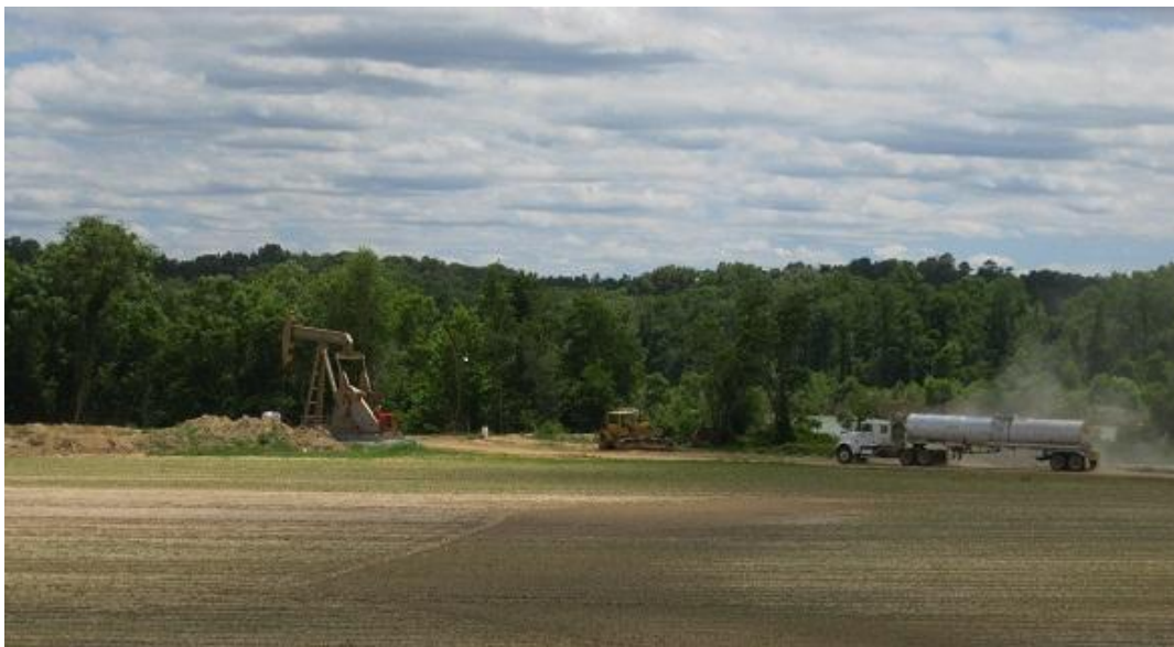
18 wheeler tanker-truck arrives at Commencement Prospect to take delivery of its first load of oil

Aus-Tex Exploration's engineering team in conjunction with its Mississippi-based Operator, is undertaking daily monitoring of the well's production and equipment.